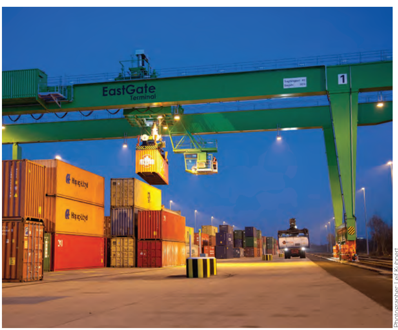
On the right track: the expansion of Frankfurt (Oder)'s Freight Village has resulted in a modern intermodal roadto-rail transfer location

(Oder)'s Freight Village, which has been in operation since 2004.